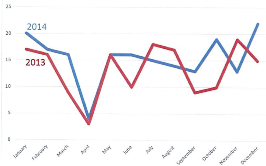
Accident Report 2014 vs. 2013

PennDOT has approved changing the Center Mill and Burnt Mill Road intersections to a 4-way stop. Completion of this change is expected in several weeks.