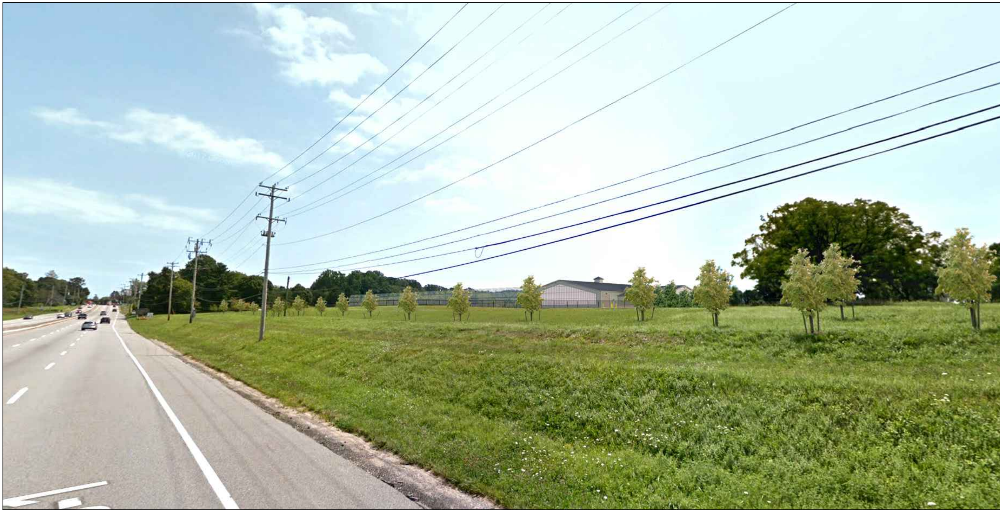
VIEW LOOKING EAST FROM INTERSECTION OF ROUTE 1 & ROUTE 52

PRELIMINARY NOT FOR CONSTRUCTION 11/19/18