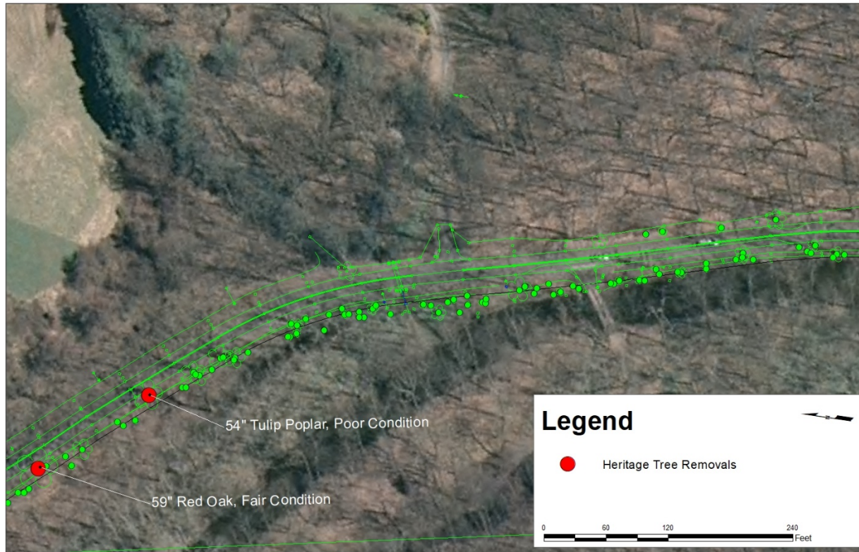
Location of 2 Heritage Trees along Chandler Mill Road approximately 1800 feet south of Oriole Dr.