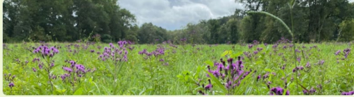
Kennett Greenway Community Survey // Encuesta a la comunidad de Kennett Greenway