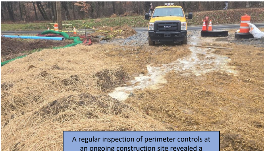
A regular inspection of perimeter controls at an ongoing construction site revealed a suspicious powder mixing with runoff.