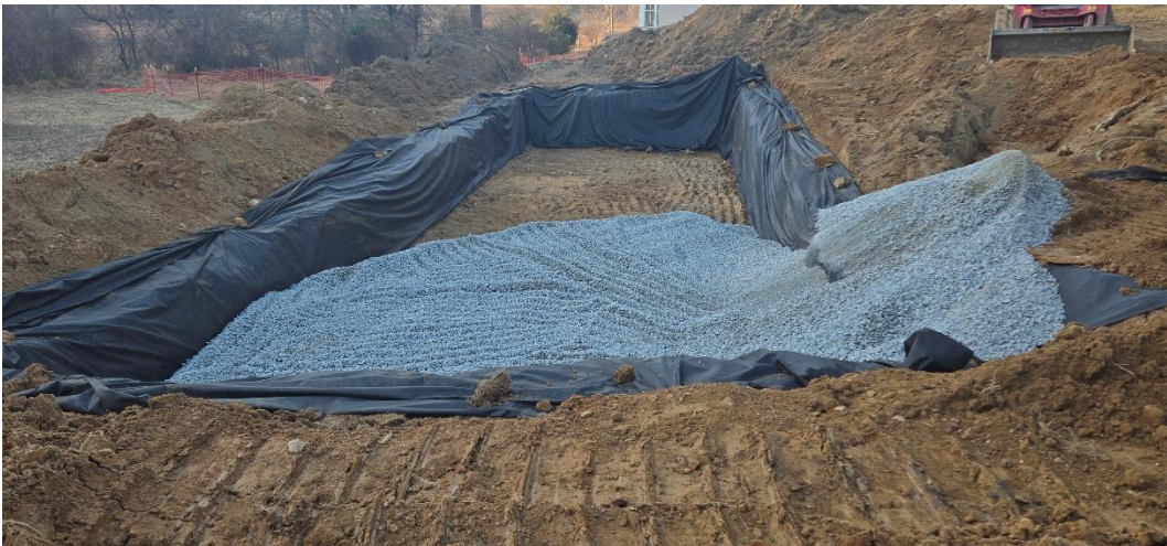
Follow-up inspection of a stormwater basin to observe the geofabric and placement of the clean stone fill.