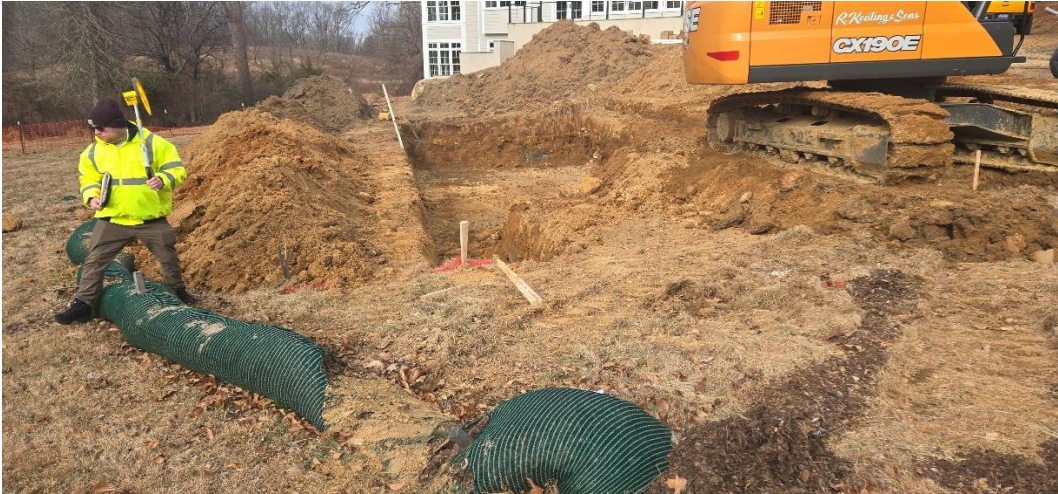
Inspection of a stormwater basin at a residential lot. Initial inspection to verify size and depth of BMP prior to filling and backfill.

Inspections for the protection of stormwater runoff is a year-round responsibility.