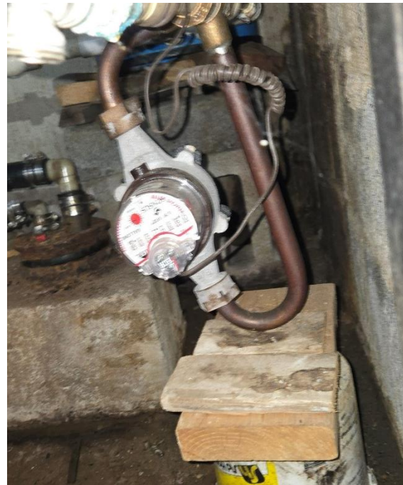
Working with the Finance/Sewer Billing Department to clear up account information